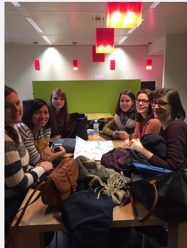
→ After lunch pause